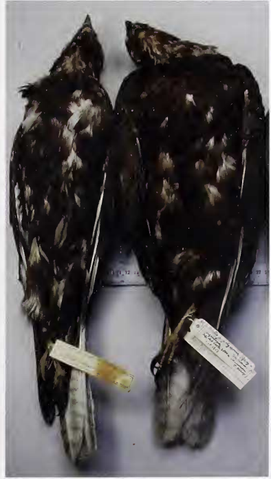
Figure 3. Upper images, dark-morph first-year Gurney's Hawks B. poecilochrous, all from Ecuador (from left to right held at ZMUC, NHRM and ZMB); below, dark-morph first-year Variable Hawks B. polysoma, from several countries; the left-hand specimen held at IRSNB, the others at NHRM